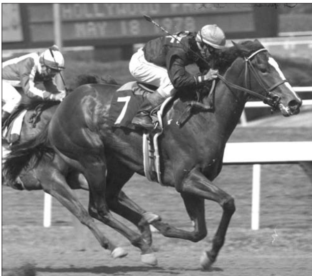
Tourulla—Junior League Stakes—June 1, 1978